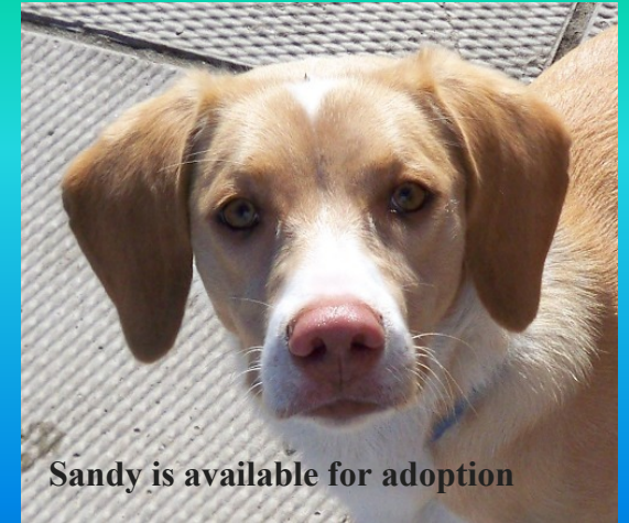
Sandy is available for adoption

Thank you in advance for considering this gift option. By remembering People for Pets in your will or estate plan, you are giving the gift of a second lease on life for many animals who look to us for the very basic of care. Your gifts, no matter the size, are paws-i-tively appreciated!